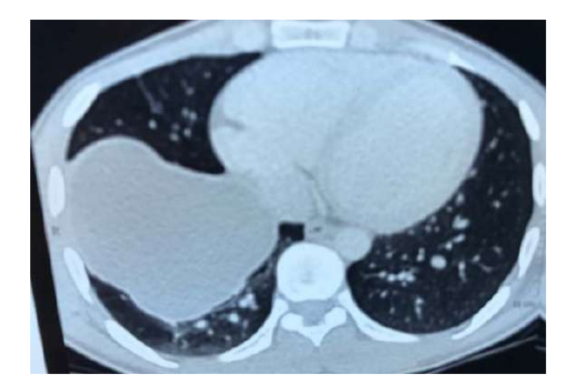
Fig. 2: Preoperative CT Scan Showing Intact Hydatid Cyst in the Right Lower Lobe