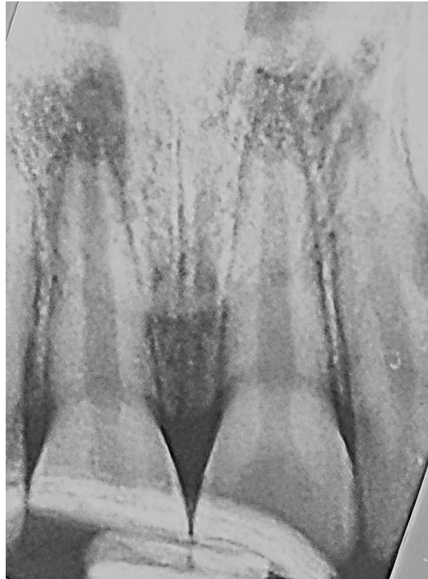
Figure 1. Permanent maxillary right central incisor with open apex and periapical radiolucency

closed using glass ionomer cement. Patient was followed up every 3 months once for a period of 9 months (Figures 2, 3 and 4). Following 9 months follow-up, radiographic examination was performed which showed complete formation of the root apex with complete periapical healing, absence of periapical radiolucency and with no clinical signs and symptoms (Figure 4). Presence of apical barrier formation was confirmed using a 30 size paper point which provided a resistant or stop and absence of haemorrhage, sensitivity and exudate. Patient was scheduled for further treatment.