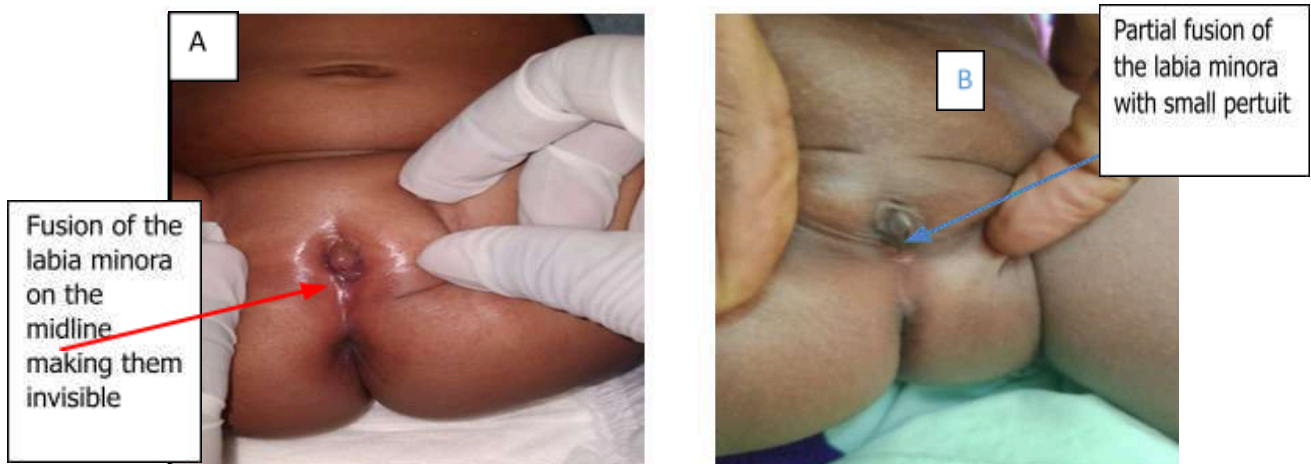
Figure 1: Distribution according to clinical form:

[A]: Complete Form (infant 4 months ); [B]: Partial Form (6 months old infant)