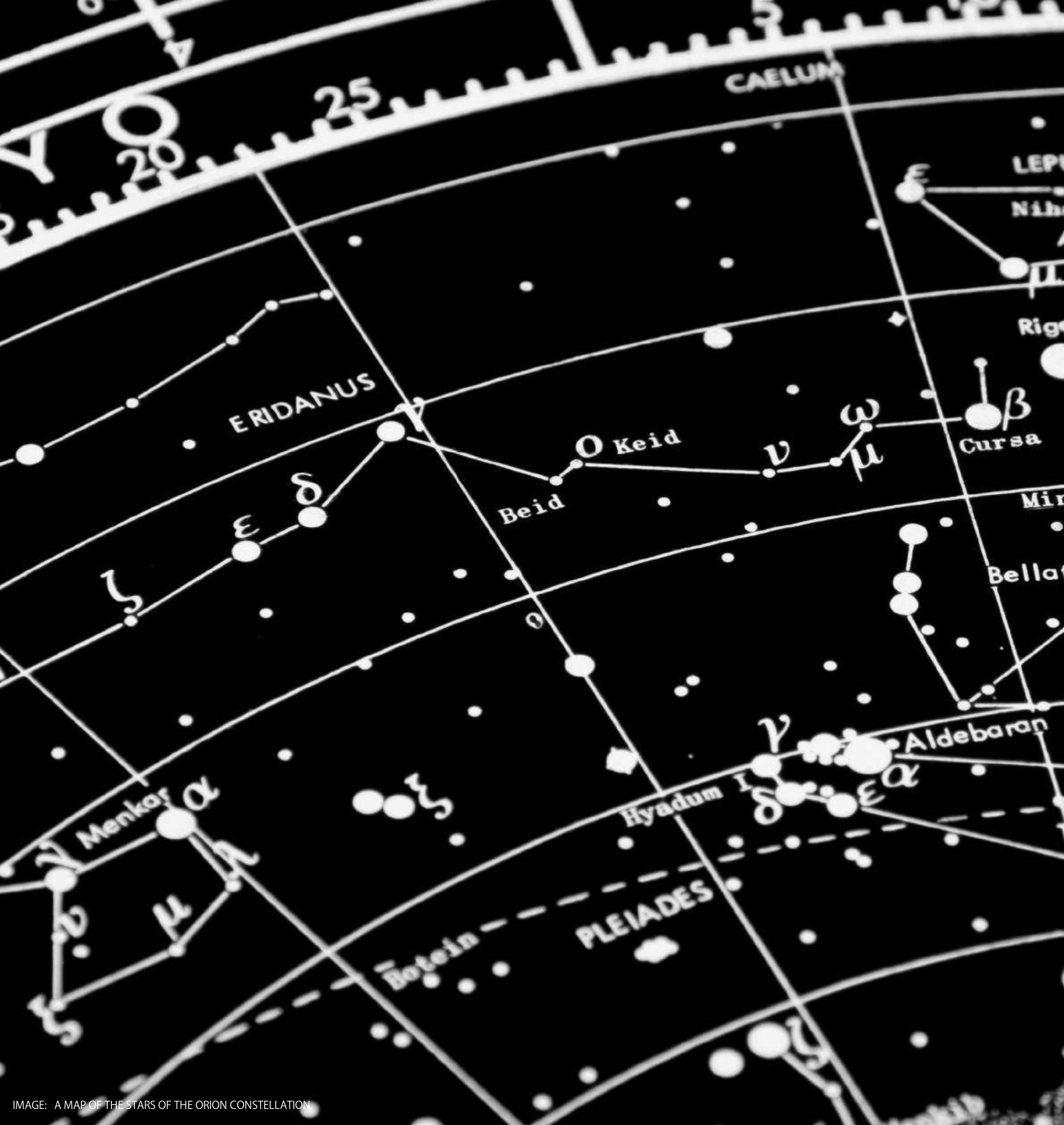
IMAGE: A MAP OF THE STARS OF THE ORION CONSTELLATION