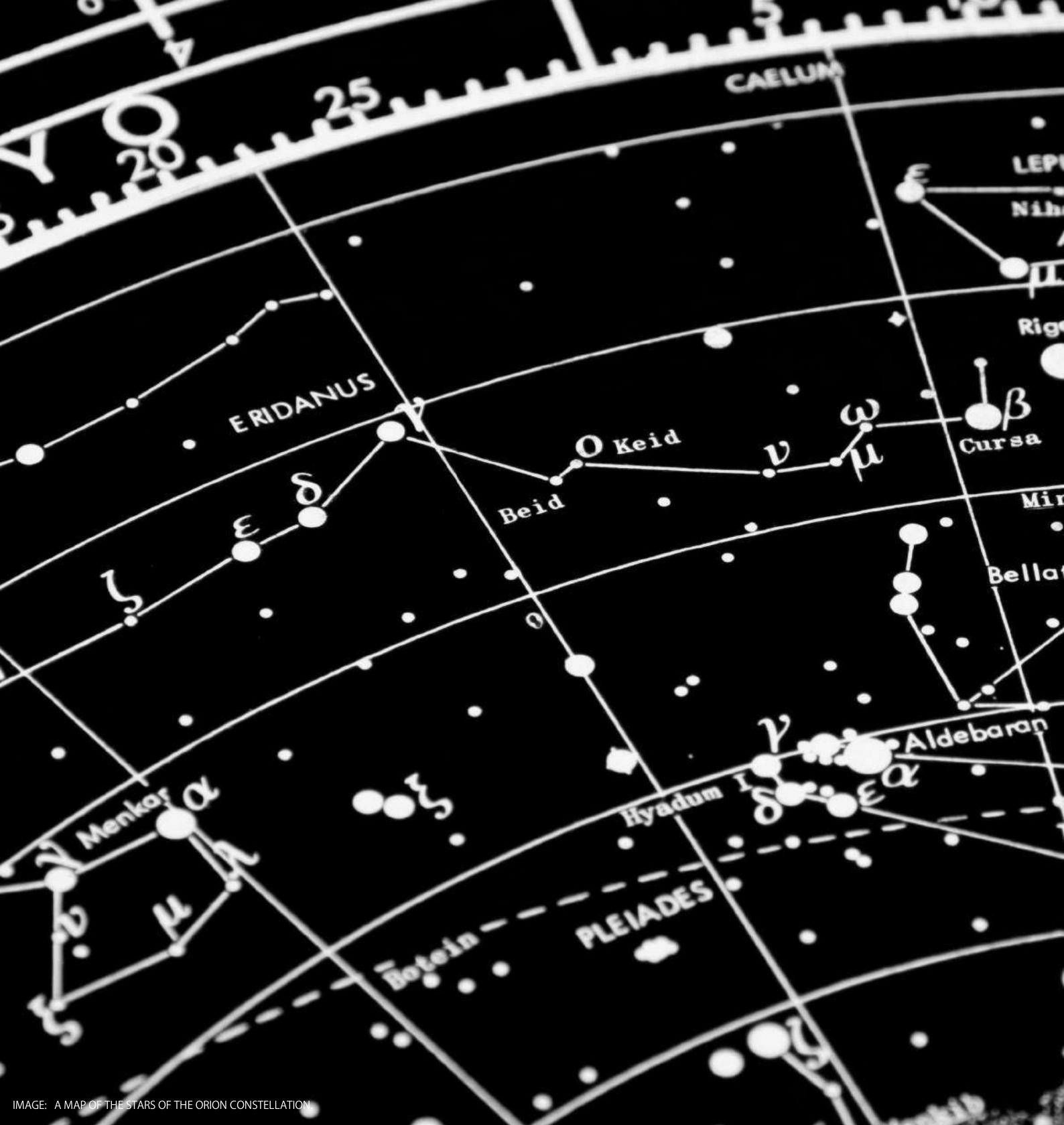
IMAGE: A MAP OF THE STARS OF THE ORION CONSTELLATION

Print ISSN: 2515-5784 Online ISSN: 2515-5792